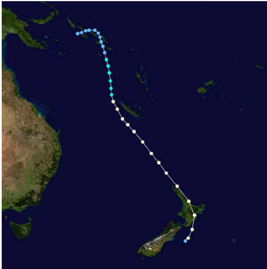
Track map of Cyclone Giselle

Passengers, not told before how serious the situation was, were now confused and frightened. People slid across the sloping deck, trying to make their way to the