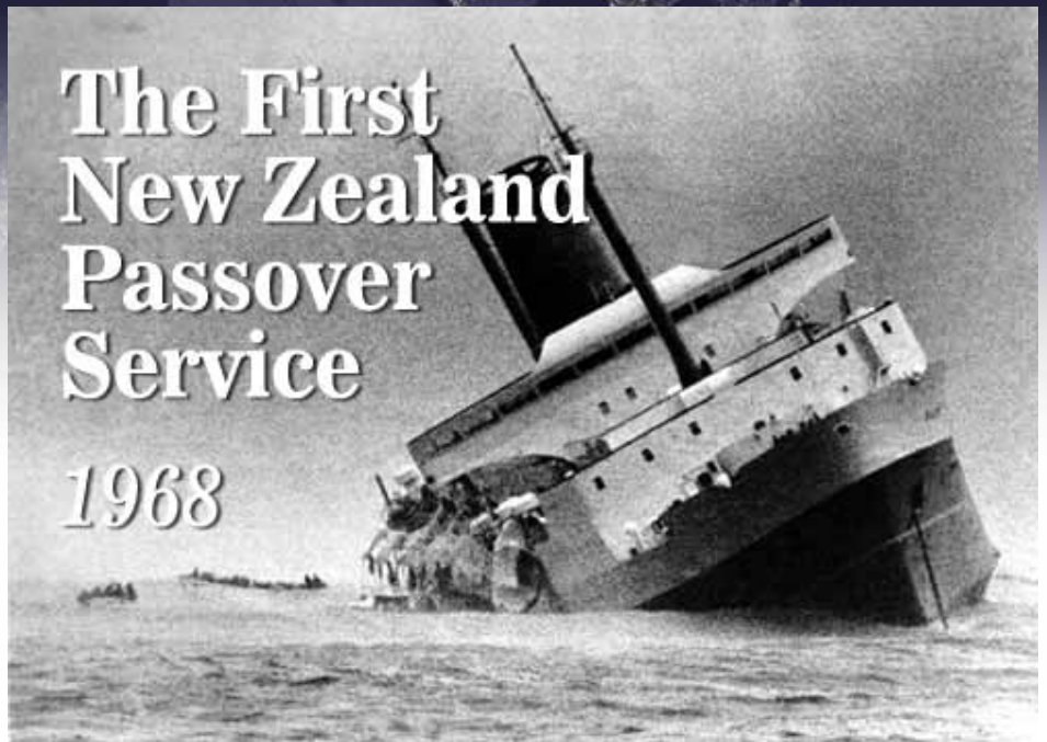
The TEV Wahine lists heavily to starboard as it sinks in Wellington Harbour. Lifeboats from the ship can be seen to the left.